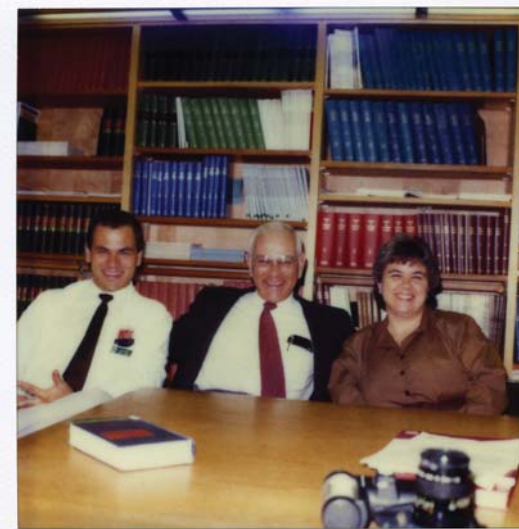
The Burket Family Photo 11-11-92