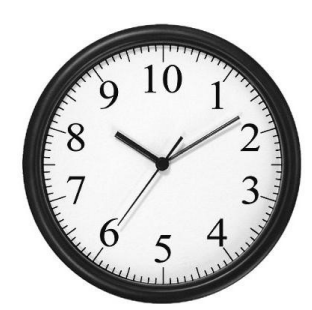
Extra time for your appointment