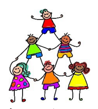
A support person